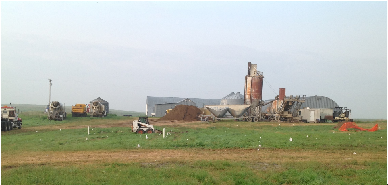
Verkaik Farmstead Project area: The white pin flags mark the locations of holes drilled to locate the mine workings. With no mine map to use as a guide, drilling was the only way to find the mine. The contractor's batch plant is in the background. The two white pipes are hole casings that hit obstructions when inserted into the drill hole.