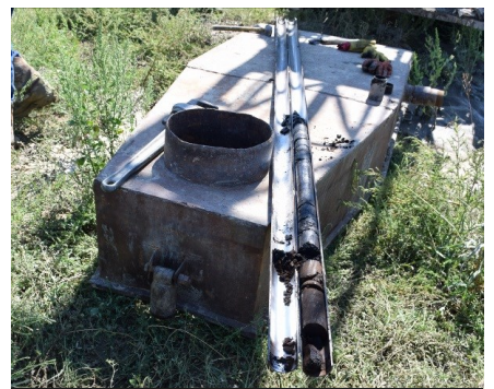
Andy's Mine Confirmation drilling: Solid coal was encountered on this confirmation drill hole.