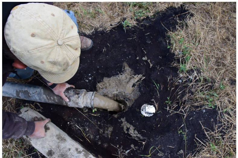
Gravity back filling drill holes with grout in the ditch of the Farm to Market road.