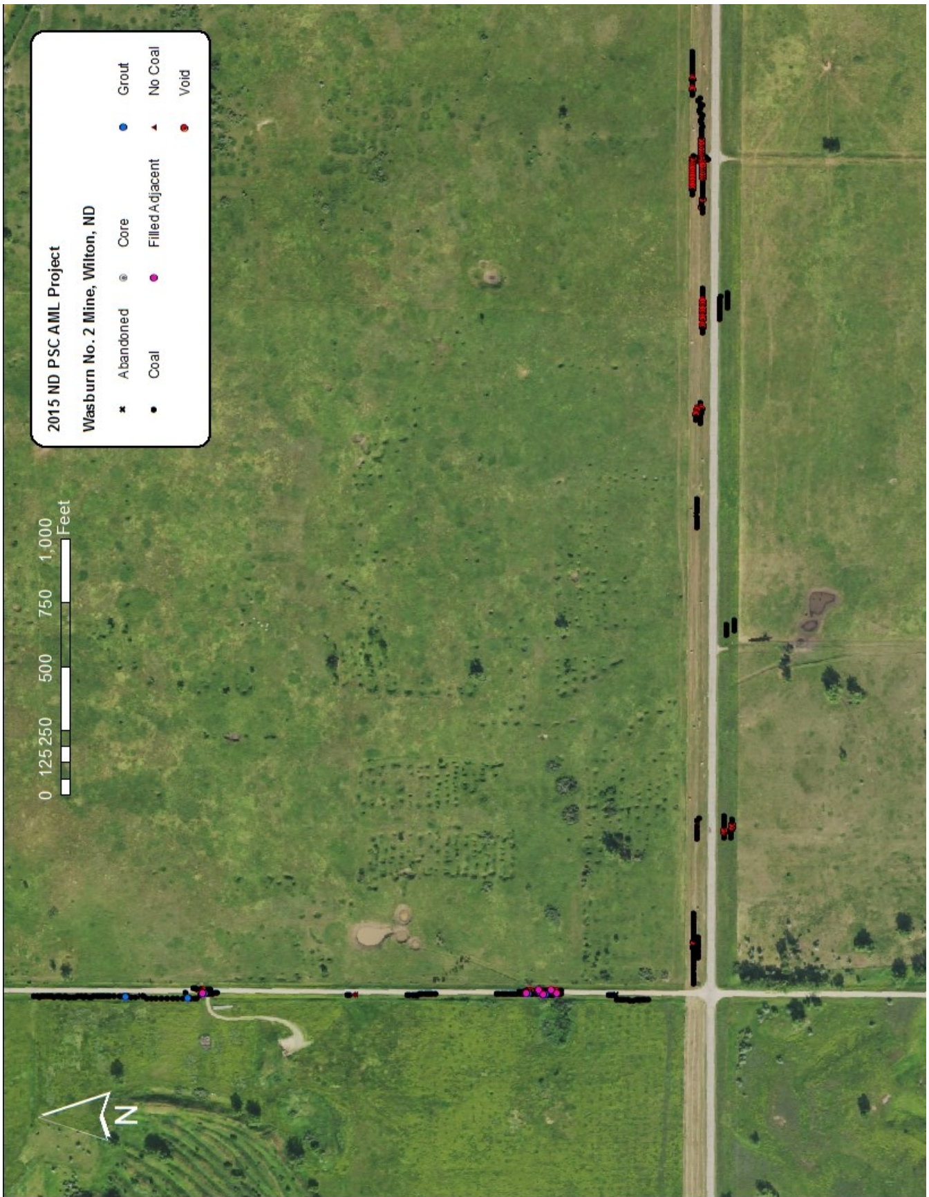
Map of the work done on the Wilton No. 2 Mine near Wilton. The black dots represent holes that were drilled and hit solid coal. The red dots are holes that intercepted mine voids and have not been filled. The blue dots are void or rubble holes that have been filled with grout. The pink dots represent either void or rubble holes that were filled when grout being pumped on a nearby hole flowed into it. This map includes holes that were drilled in 2014 and 2015. The pock marks in the center of the map are sinkholes caused by the collapse of the mine workings.