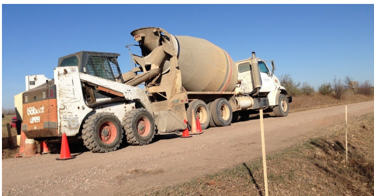
The 2015 drilling and grouting AML project included five areas near Reeder, Scranton, Bowman and Wilton, ND. This photo was taken near Wilton. Grout is being pumped into a haul tunnel that is about 45 feet below the surface. The Bobcat hides the grout pump. The two stakes mark the locations of cased drill holes that are located on the road.