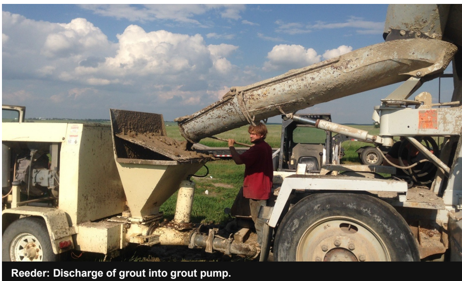
Reeder: Discharge of grout into grout pump.