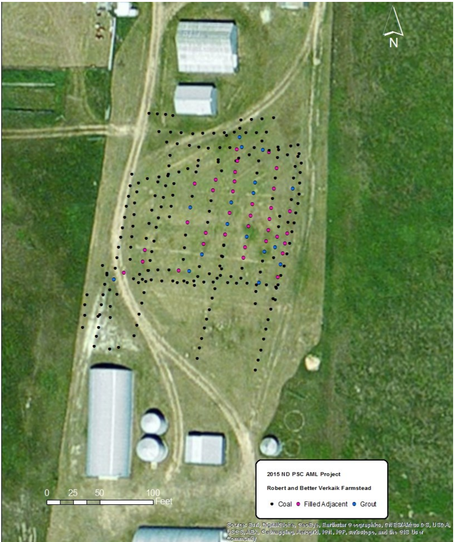
Map of the work done at Reeder. The black dots represent holes that were drilled and hit solid coal. The blue dots show where either a void or rubble was encountered when drilling. These were pumped with grout. The pink dots represent either void or rubble holes that were filled when grout being pumped on a nearby hole flowed into it. This map includes holes that were drilled in 1997, 2012 and 2015. The coal in the mine was about 30 feet below the surface.