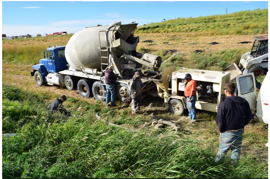
Gravity back filling drill holes with grout in the ditch of the Farm to Market road.

We also have a bore hole camera that can be lowered into the void. With the right conditions, we are able to see a small part of the mine. The camera was instrumental in 2015 for estimating the amount of grout needed in Reeder & Bowman.