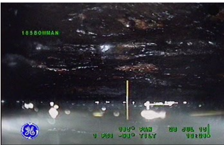
Halleck Mine: The vertical line is a tape measure in a drill hole ten feet away. This room extends well beyond the tape. At the top is the coal roof. At the bottom the mine is partially filled with water.

Seeing the condition of the mine helps us to estimate how much grout will be needed. We look to see if it open or caved in, and if we see coal. If coal is not seen, it could mean the roof has collapsed leaving a hole above the coal— called void migration. Eventually this may become a sinkhole at the surface. In Reeder, we could see an open haul tunnel that we didn't find with drilling. In Bowman we could tell the rooms were very large— too large to fill completely, so we modified our grouting plan. Also at Bowman, we watched grout flow in a haul tunnel as the grout was being pumped over 100 feet away. This confirmed the grout was going where we wanted it.