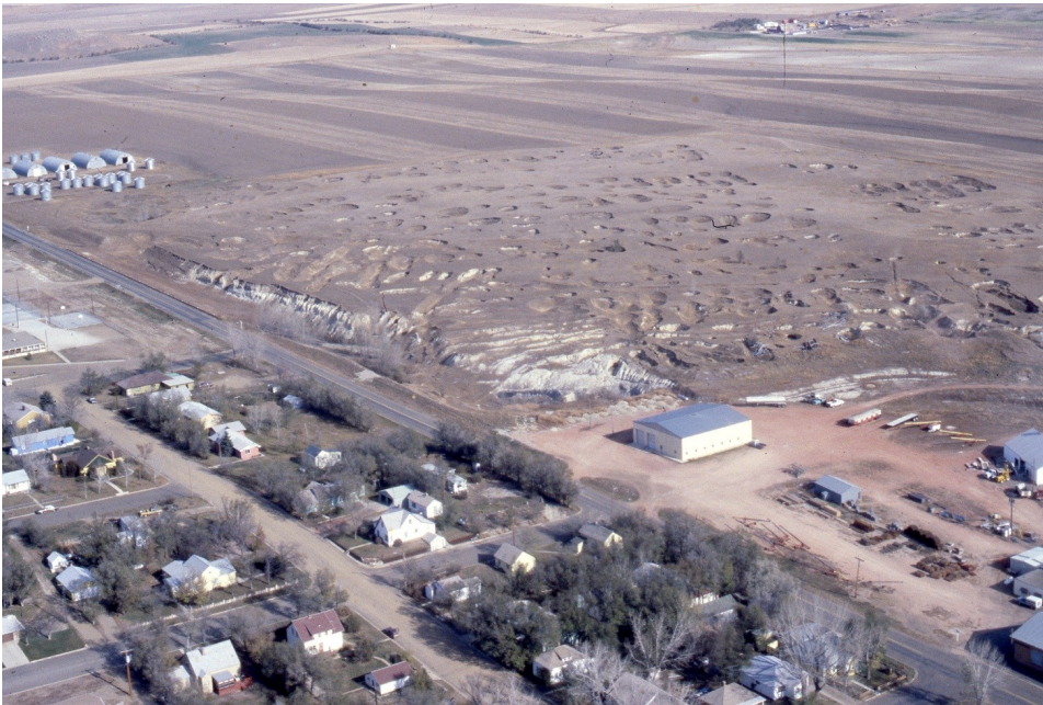
Scranton circa 1980. The pock marked surface of sinkholes shows the location of the abandoned Scranton Lignite Mine. Highway 67 runs diagonally across the picture. The surface portion of the mine is visible near the highway.