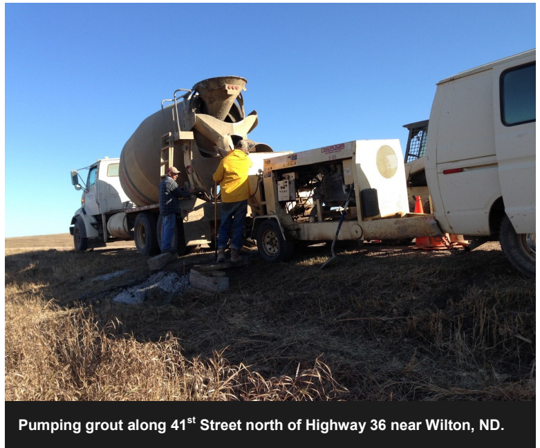
Pumping grout along 41 st Street north of Highway 36 near Wilton, ND.

Void — A general term for openings in rock. In mine reclamation-the open space remaining after coal was removed by underground mining.