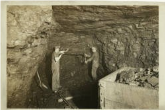
Mining coal at the Wilton Mine circa 1915.