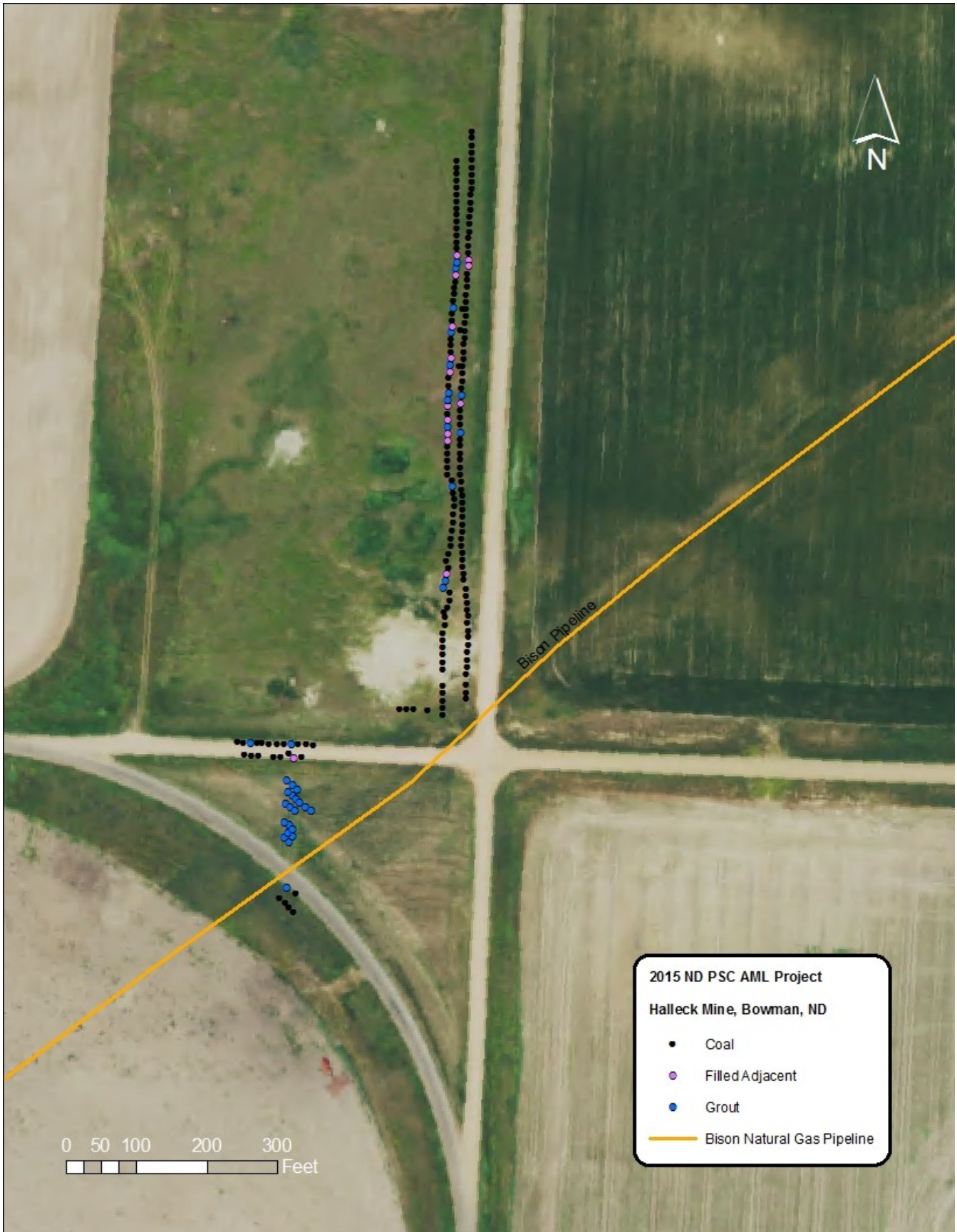
Map of the work done on the Halleck Mine near Bowman. The black dots represent holes that were drilled and only hit coal. The blue dots show where either a void or rubble was encountered when drilling. These were pumped with grout. The pink dots represent either void or rubble holes that were filled when grout being pumped on a nearby hole flowed into it. This map includes holes that were drilled in 2012 and 2015. As much as 20 feet of coal was mined out of the 30 to 40-foot coal seam.