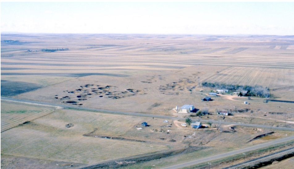
South of Scranton circa 1980. The pock marked surface of sinkholes shows the location of the abandoned Andy's Mine. US Highway 12 runs diagonally at the bottom of the picture. The current 133 rd Avenue runs behind the tree row.

Four bore holes in the same void in the east ditch of 133 rd Avenue was all that remained at the end of 2014. The void above the mined coal indicating that the mine had collapsed. Eventually the void would reach the surface as a sinkhole. In 2014 about 45 cubic yards were pumped into this void. Another 86 were added in 2015 to completely fill the void. The 2015 project completed the work at both Scranton mines.