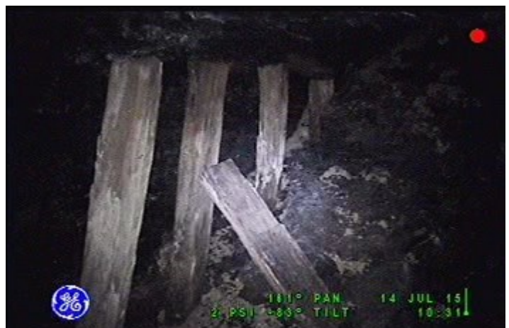
Halleck Mine: Timbers are part of the haul tunnel leading to the rooms. On the right the tunnel has partially collapsed.